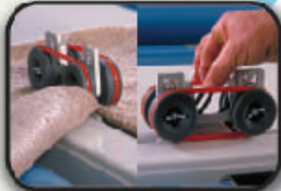
FAST, STRAIGHT CUTS

Patented, two direction, chain driven cutter uses standard blades and applies pressure to the material being cut. Get a straight, clean cut every time!