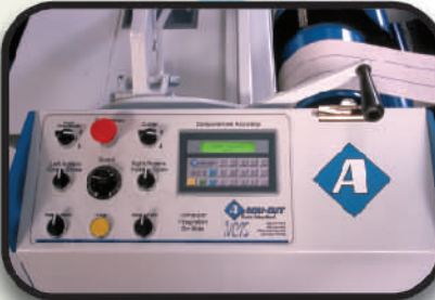
ADVANCED VARIABLE SPEED

'Infinite' speed control dial directs the variable frequency drives which automatically adjust each cradle to the proper speed. This advanced feature makes the IVC-15 even more user friendly!