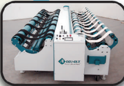
ADJUSTABLE, SQUARING CRADLE

The IVC-15's pneumatically controlled load cradle can be adjusted in three ways: shuttle forward or backward for positioning, pivot either end for squaring the material or use the 'clam shell' design to adjust for roll diameter. Provides full control!