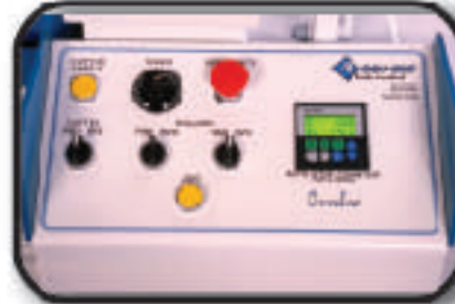
ADVANCED VARIABLE SPEED

'Infinite' speed control dial directs the variable frequency drives which automatically adjust each cradle to the proper speed. This advanced feature makes the Crossbow even more user friendly!