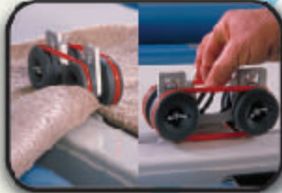
FAST, STRAIGHT CUTS

Patented, two direction, chain driven cutter uses standard blades and applies pressure to the material being cut. Get a straight, clean cut every time!