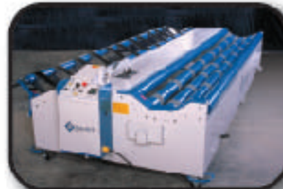
ONE PERSON OPERATION

Wrap around foot cable control, spring loaded roll up arm and cut piece dumping mechanism provide for ease of use. All are standard features on the Crossbow!