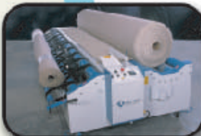
CUT PIECE REMOVAL

All Accu-Cut machines are equipped with a cut piece dumping mechanism to off load your cut length. Make multiple cuts off of one roll without using your forklift to remove the cut length!