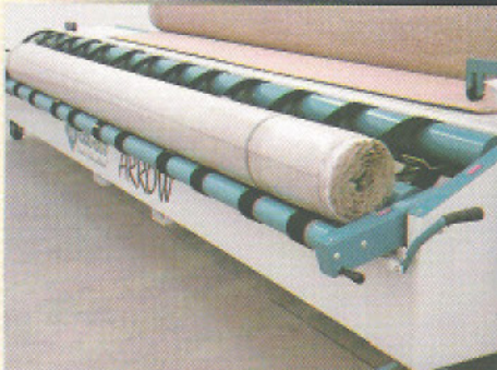
ONE PERSON OPERATION