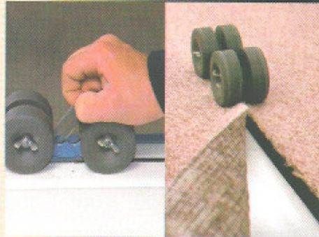
FAST, STRAIGHT CUTS