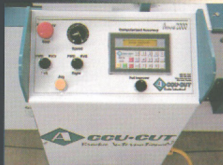
ADVANCED VARIABLE SPEED

Variable frequency drives automatically adjust each cradle to the proper speed and provide an almost infinite number of speed settings.