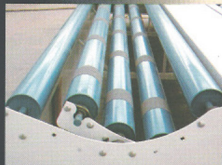
ADJUSTABLE LOAD CRADLE

The Arrow's open ended, beltless load cradle holds even the largest rolls. The cradle features a roll improver that adjusts the position of the roll.