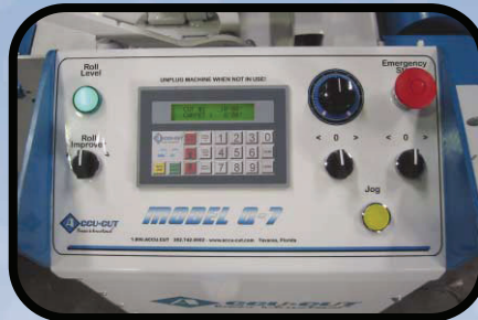
USER FRIENDLY CONTROLS

Directional switches control the rollers - the yellow push button activates them. Speed selection dial, easy to use expanded PLC interface and emergency stop button. An auto-run feature makes operating the machine even simpler!