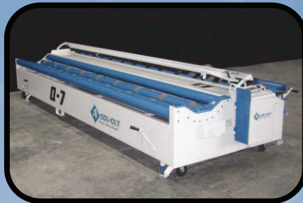
ONE PERSON OPERATION

Wrap around foot cable control, spring loaded roll up arm, speed control, auto run feature and open ended cradles provide for ease of use. All are standard features on the Q-7!