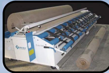
CUT PIECE REMOVAL

All Accu-Cut machines are equipped with a cut piece dumping mechanism to off load your cut length. Make multiple cuts off of one roll without using your forklift to remove the cut length!