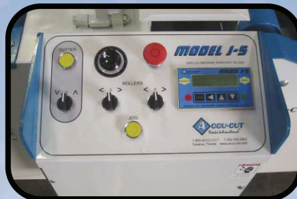
USER FRIENDLY CONTROLS

Directional switches control the rollers and cutter - the yellow push buttons activate them. Speed selection dial, easy to use PLC interface and emergency stop button. An auto-run feature makes operating the machine even simpler!