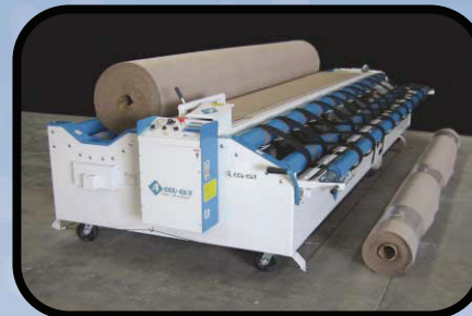
CUT PIECE REMOVAL

All Accu-Cut machines are equipped with a cut piece dumping mechanism to off load your cut length. Make multiple cuts off of one roll without using your forklift to remove the cut length!