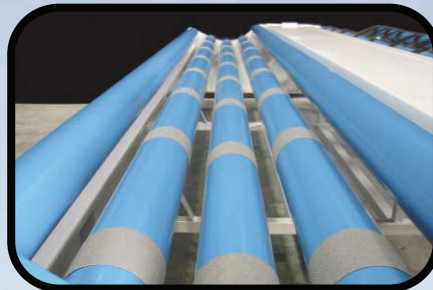
BELTLESS LOAD CRADLE

The j-5's open ended, beltless load cradle holds even the largest rolls. The steel rollers center the material in the cradle. This helps to ensure the material rolls up straight every time!