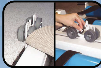
FAST, STRAIGHT CUTS

Patented, two direction, chain driven cutter uses standard blades and applies pressure to the material being cut. Get a straight, clean cut every time!