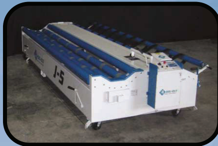
ONE PERSON OPERATION

Wrap around foot cable control, spring loaded roll up arm, speed control, auto run feature and open ended cradles provide for ease of use. All are standard features on the j-5!