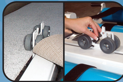
FAST, STRAIGHT CUTS

Patented, two direction, chain driven cutter uses standard blades and applies pressure to the material being cut. Get a straight, clean cut every time!