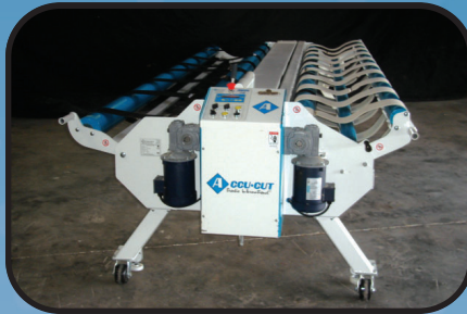
ONE PERSON OPERATION

Wrap around foot cable control, spring loaded roll up arm, speed control, auto run feature and open ended cradles provide for ease of use. All are standard features on the J-2!