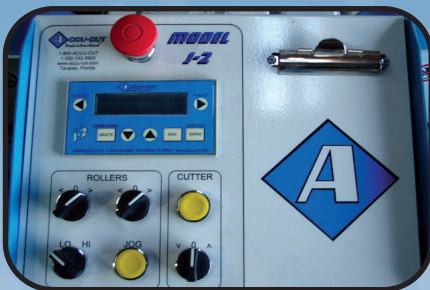
USER FRIENDLY CONTROLS

Directional switches control the rollers and cutter - the yellow push buttons activate them. Speed selection switch, easy to use PLC interface and emergency stop button. An auto-run feature makes operating the machine even simpler!