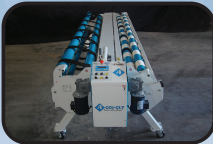
SPACE SAVING DESIGN

The J-2's convenient fold-in cradles minimize the floor space required. At 48 inches wide the J-2 can easily be stored under your storage rack!