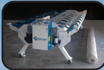
CUT PIECE REMOVAL

All Accu-Cut machines are equipped with a cut piece dumping mechanism to off load your cut length. Make multiple cuts off of one roll without using your forklift to remove the cut length!